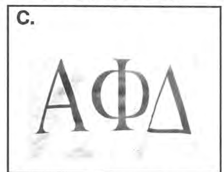
C. Grey crew neck sweatshirt (L, XL, XXL) $22