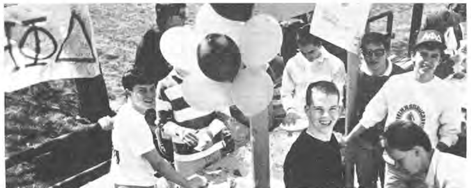
Alpha Phi Delta brothers raise money for the homeless of Philadelphia during Villanova University's annual Balloon Day.