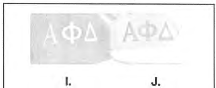
Alpha Phi Delta baseball caps $10 each I. Purple Corduroy J. White Corduroy