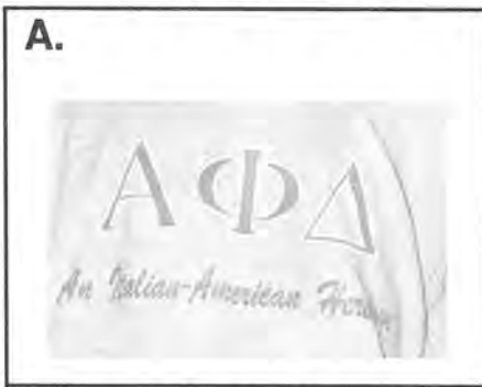
A. Grey t-shirt (L, XL, XXL) $10