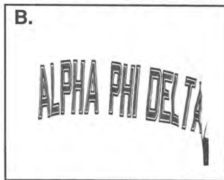
B. White with purple lettering (L, XL, XXL) $10