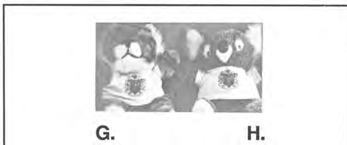
Stuffed animals in Alpha Phi Delta t-shirts G. Tiger $15 H. Koala Bear $15