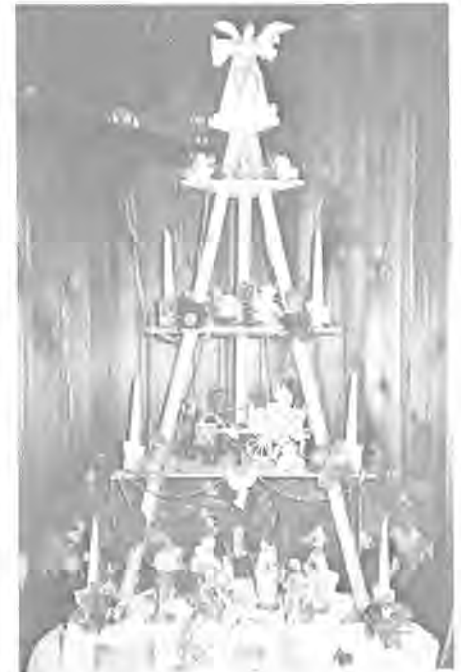
The Ceppo, the "Christmas Tree" in an Italian home.

Children in Italy receive their gifts on January 6, the Feast of the Epiphany. Traditionally, on the eve of the Epiphany, the children placed their shoes on the hearth, but the modern custom is to hang stockings, in anticipation of the visit of "La Befana," an old, ugly witch. According to legend, "La Befana" was asked by the Wise Men for directions to Bethlehem. They explained their mission and invited her to join them, but she declined.